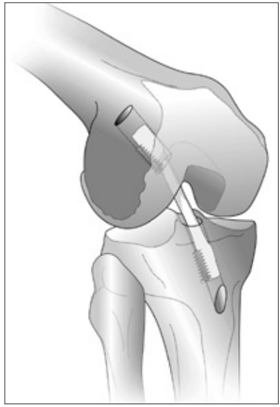
Figure 3: Example of a bone-patellar tendonbone graft using two interference screws