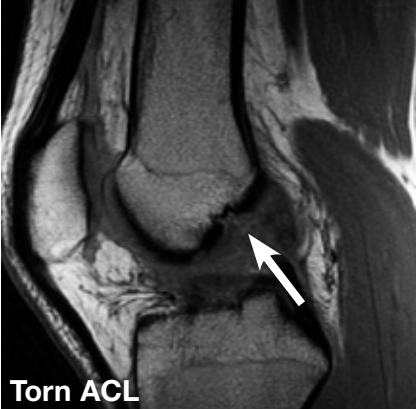
Figure 1: MRI images of the ACL of the knee

athletic trainer will assess the knee's laxity, compared to the uninjured knee, using a Lachman's test and an anterior drawer test. They will also test the rotational stability component with a test called the pivot shift test. This test attempts to reproduce the athlete's sensation of buckling or giving out.