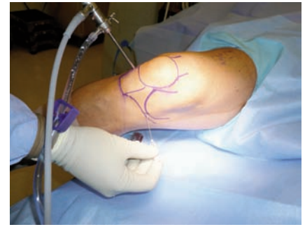
Figure 1. Outside view of spinal needle insertion as valgus force is maintained by the surgeon. View of a right knee from its medial aspect. The knee is held in near full extension while the surgeon applies controlled valgus stress by pushing his pelvis against the medial malleolus. The arthroscope (seen at the top of the picture) is viewing from the lateral parapatellar portal. The surgeon's right hand inserts the 18-gauge spinal needle at the medial aspect of the knee.