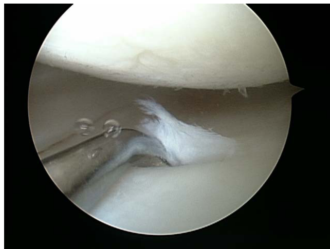
Figure 1 Arthroscopic view of the medial femoral tibia joint. A grade I (ICRS) lesion was noted on the medial femoral condyle and a grade III lesion with cartilage flap was seen on the medial tibia.

was closed with nylon sutures and sterile dressings were applied.