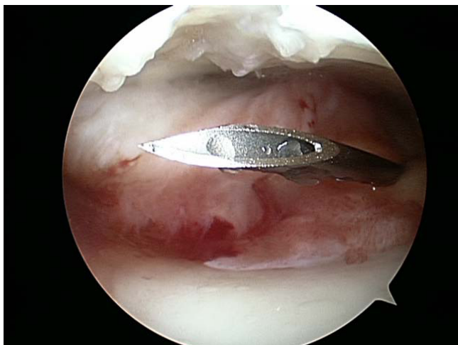
Figure 3 An 18 gauge needle is inserted into the patellofemoral joint under direct arthroscopic visualization.

six months post operatively. Any complications were documented at each visit. A physical therapy (PT) directed rehab protocol was implemented at one week as per the surgeon's standard of care. Each patient received three treatment of PT per week with no restrictions. All patients were asked to complete SF-36 PCS and WOMAC questionnaires at the pre op, six week, three month, and six month visits.