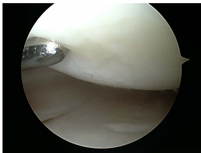
Figure 2 Post arthroscopic debridement of the chondral lesions on the medial femoral condyle and the medial tibia.

Post-operatively, patients were allowed to weight bear as tolerated with the use of crutches if necessary and were given a two week prescription for narcotic analgesics (Vicodin 5/500 mg) for pain control. Patients were asked to ingest one enteric coated aspirin per day for two weeks for DVT prophylaxis. The subjects were scheduled to have appointments at one week, six weeks, three months and