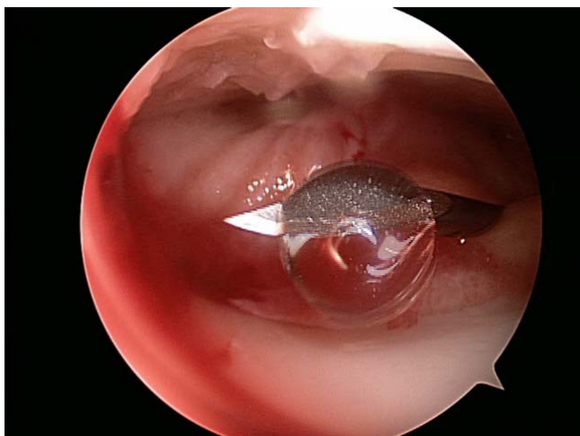
Figure 4 Hyaluronic Acid (6 ml/90 mg of Orthovisc®) is injected into the knee joint via an 18 gauge needle and under direct arthroscopic visualization.

six months post operatively. Any complications were documented at each visit. A physical therapy (PT) directed rehab protocol was implemented at one week as per the surgeon's standard of care. Each patient received three treatment of PT per week with no restrictions. All patients were asked to complete SF-36 PCS and WOMAC questionnaires at the pre op, six week, three month, and six month visits.